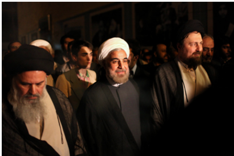
Rohani after his election to Iranian presidency

These words of sacrilege were uttered by Rohani about eight years ago, on August ۳۰, ۱۹۸۶, in a meeting between him and the late Amiram Nir, who then was the counterterrorism advisor to the Israeli prime minister. The fact of the meeting was never reported. Present at the meeting at a Parisian hotel, together with Nir and Rohani, was one Manucher Ghorbanifar, a prominent Iranian arms dealer living in Europe. Ghorbanifar's record included brokering a few weapons-for-hostages deals involving Israel and the US; the most high-profile of those was the Iran-Contra Affair, or Irangate, which saw accusations that the Reagan Administration secretly facilitated the sale of arms to Iran – the subject of an arms embargo under the US Arms Export Control Act (AECA).